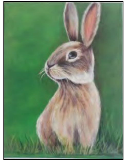
Spring Bunny $8.00