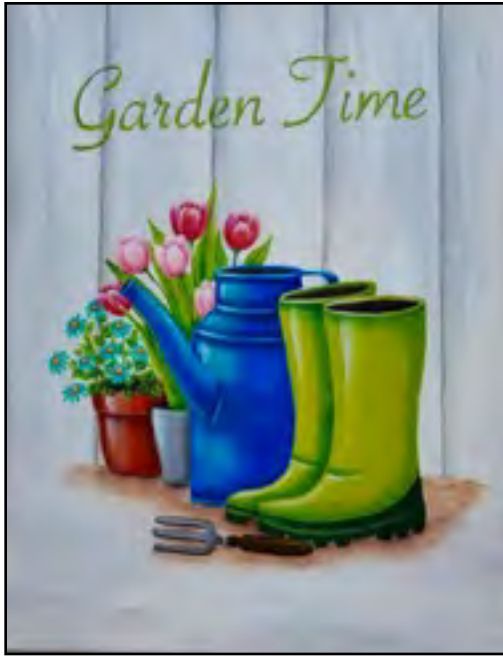
Garden Tours $12.00